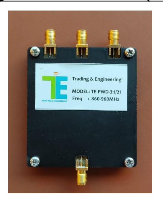
Fig 2. POWER DIVIDER (3:1)