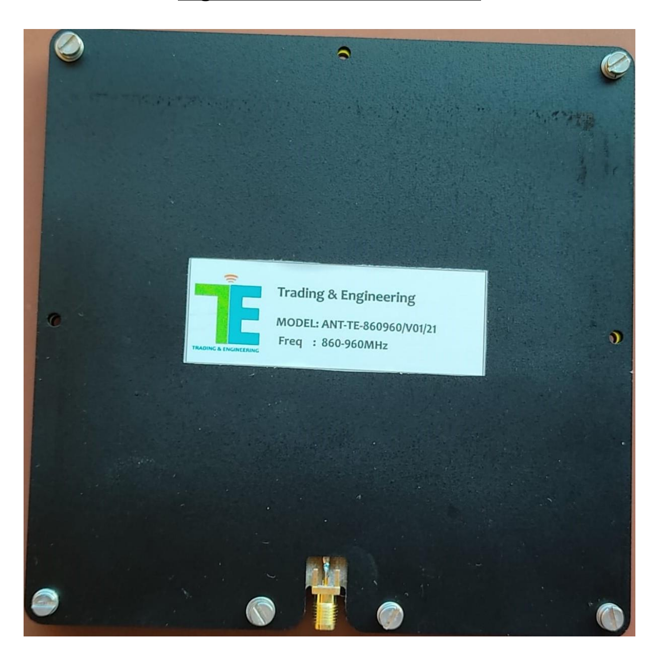
Fig 1. UHF RFID ANTENNA